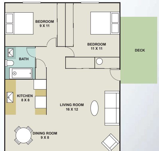
2 Bedroom : 612 sq ft